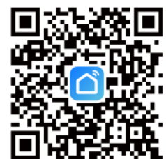
Smart Life App